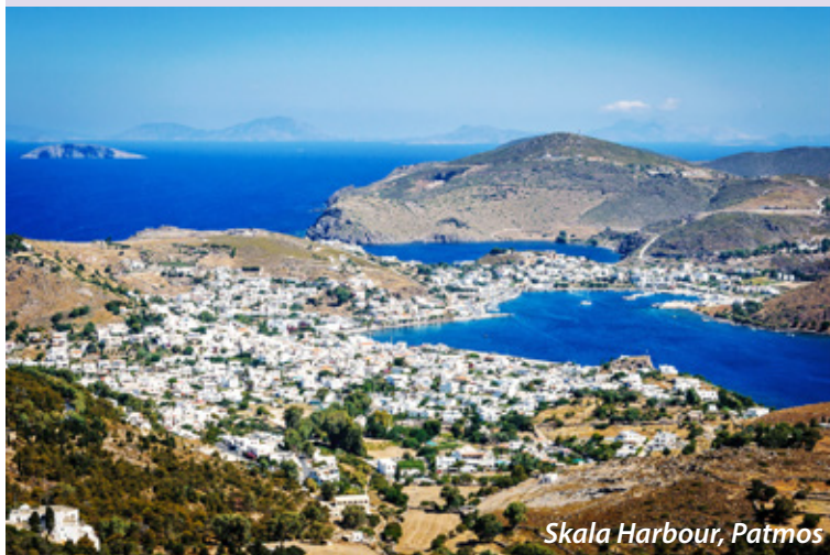
Skala Harbour, Patmos

$390 Per Person in Double Occupancy $140 Single Room Supplement