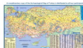
Archaeology Map of Turkey