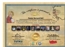
Certificate of Participation